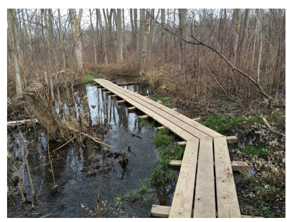
So we build bridges and boardwalks.

While infamous for killing trees, beaver dams actually create diverse habitats. Grasses, sedges, bushes and saplings grow on the perimeter of the pond. These plants provide food and cover for foraging animals. Beaver ponds become magnets for a rich variety of wildlife. From important game species like wood duck, mink and otter, to vulnerable anadromous fish like rainbow smelt, steelhead and salmon, biodiversity thrives due to beaver ponds. Beaver dams also protect downstream