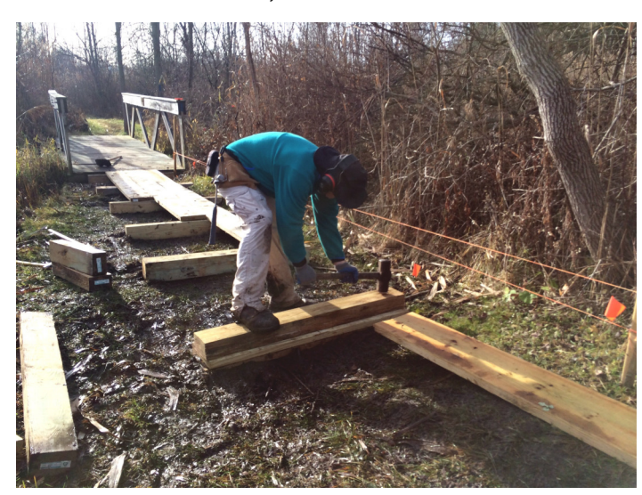
Chauncy driving re-rod into the ground.

The footbridge build by Boy Scout Jack Napalitano several years ago needed an extension boardwalk due to the activities of the beavers in Lehigh Crossing Park. So Chauncy Young took some measurements, make some calculations