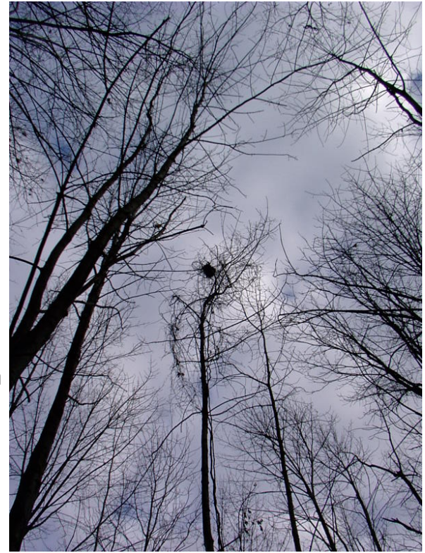
Do you see the squirrel's nest?

in the year but now stand out in the forest.