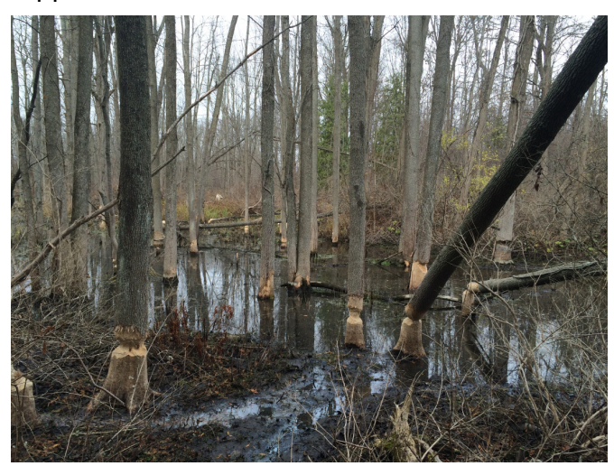
The beaver are active in Lehigh Crossing Park.

How is this possible? By opening the tree canopy, sunlight reaches the water and triggers an explosion of biological activity. Algae and aquatic plants grow in the sun drenched. nutrient rich water. This organic material supports microscopic organisms, which are eaten by a variety of invertebrates. These become food for fish. birds and mammals. An entire food chain is created in a beaver pond.