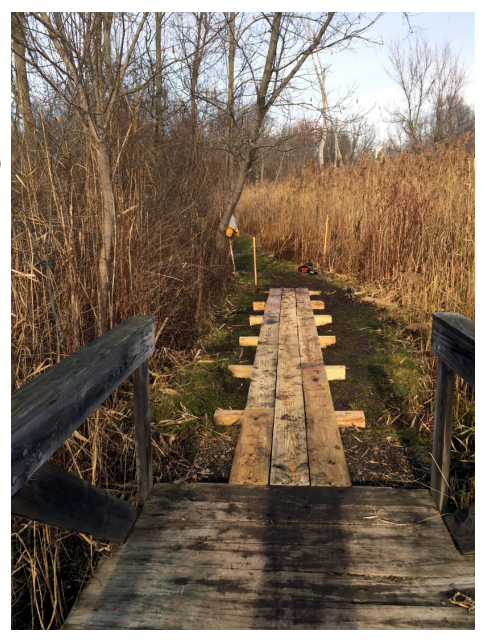
The finished boardwalk.

spent about 2 hours constructing the 24-foot long boardwalk, so hikers can now keep their feet dry. It's on the Trolley Trail (blue blazes). Check it out sometime.